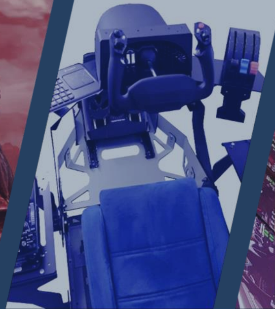
HARDWARE DESIGN & MANUFACTURE